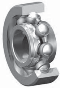
Unflanged Ribbon Cage