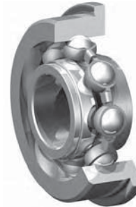
Flanged Ribbon Cage