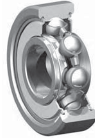
Shielded Ribbon Cage