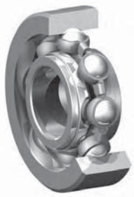
Open Ribbon Cage